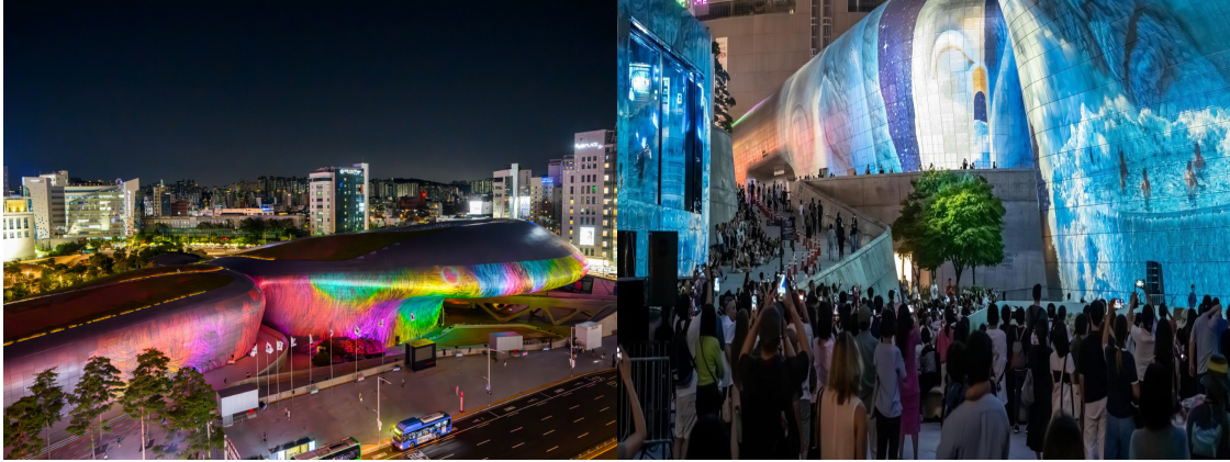
Example of Seoul Light DDP fall 2025 projection